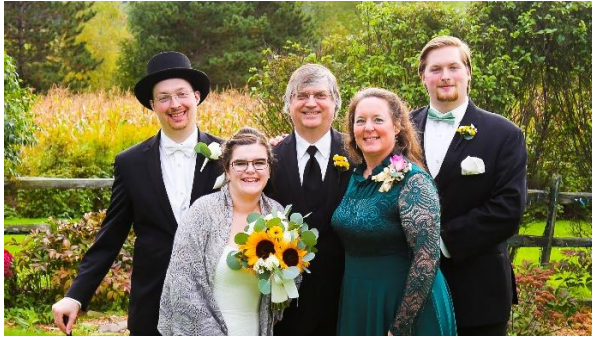
picture from family wedding photo

Most of us, if not all, have experienced having someone join our family – through birth, adoption, marriage. Hopefully getting accustomed to the new family member(s) was a happy process, building ties of love. After the initial “wow” factor wears off, they remain important to our family. Family events include the new person(s) as a matter of course.