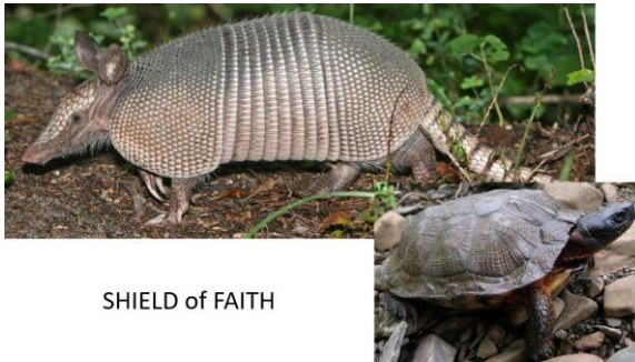
SHIELD of FAITH