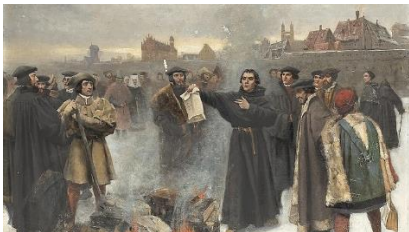
picture from https://commons.wikimedia.org/wiki/File:Karl_Aspelin-Luther_uppbr%C3%A4nner_den_p%C3%A5fliga_bullan.jpg ; painting by Karl Aspelin "Luther burns the Papal bull in the square of Wittenberg year 1520"

Notice that the apostles were first sent out within their own extended families, the house of Israel. After the resurrection, rejected by the Jewish leadership, they took to the countryside and proclaimed the resurrection to all people.