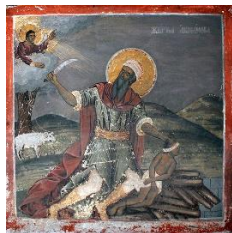
Abraham's sacrifice - a fresco from the Old church of Raduil, Bulgaria

I think it is a symptom of our sinful world that we may turn away from those who are different from us, especially when they are in need. Some people have been so hurt by such dismissals that their souls silently cry out like the psalmist cried aloud: "How long must I bear pain in my soul, and have sorrow in my heart all day long?"