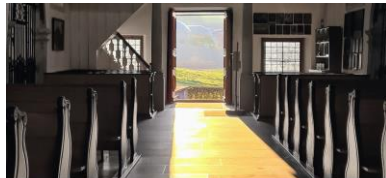
ENTER THE GATES OUR HYMN OF GRATEFUL PRAISE WORSHIP SERIES