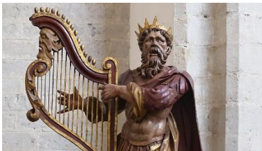
Statue of King David playing the harp in the Great Church of Breda

In 2 Samuel, those who rule justly and fear God are a blessing for the people, while the godless hurt them. In the psalm, we hear the Lord's promise to bless David's lineage dependent on their keeping the covenant. Why do you think God put in that contingency? <Let them respond>