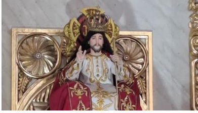
Christ the King statue, Antipolo Cathedral

Does anyone know the origins of this Reign of Christ Sunday? <Let them respond>